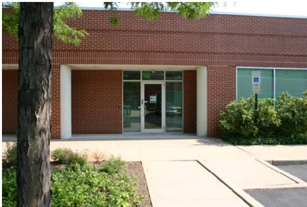
Suite 255 – Front Private Entrance