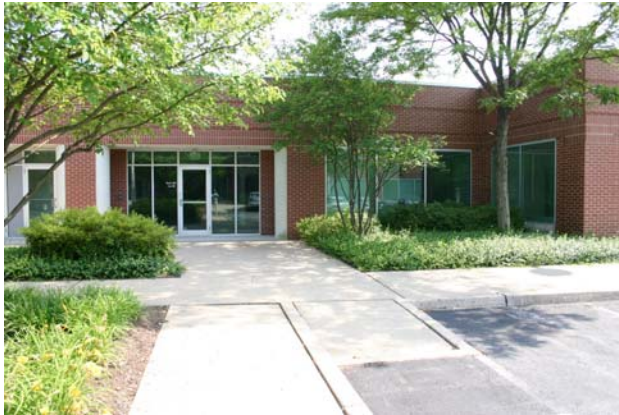
Suite 260 – Front Private Entrance