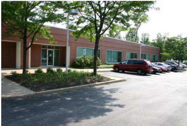
Suite 255 – Front View