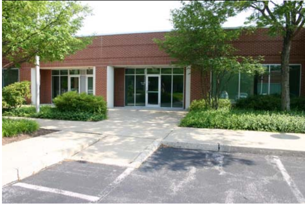
Suite 260 – Front View